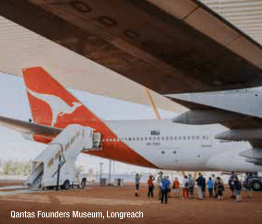
Qantas Founders Museum, Longreach