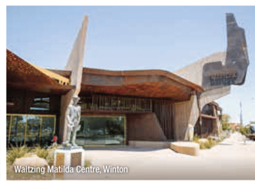
Waltzing Matilda Centre, Winton