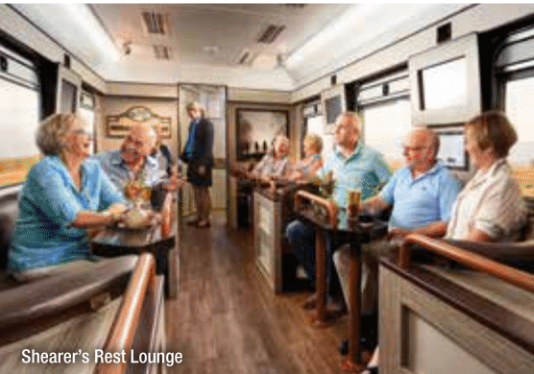
Shearer's Rest Lounge