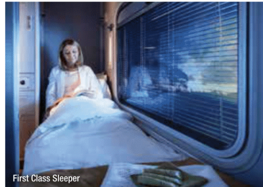
First Class Sleeper