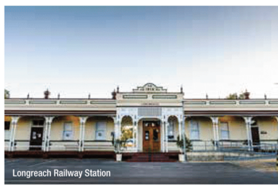
Longreach Railway Station