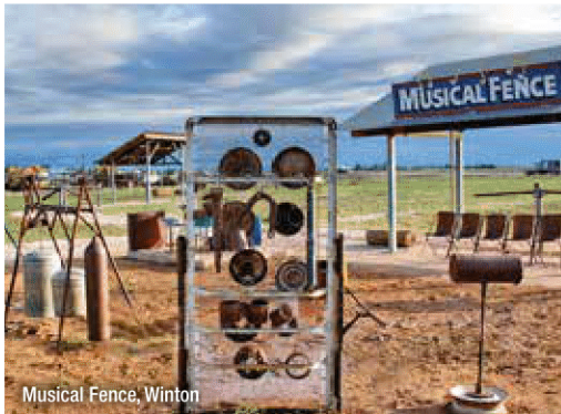
Musical Fence, Winton